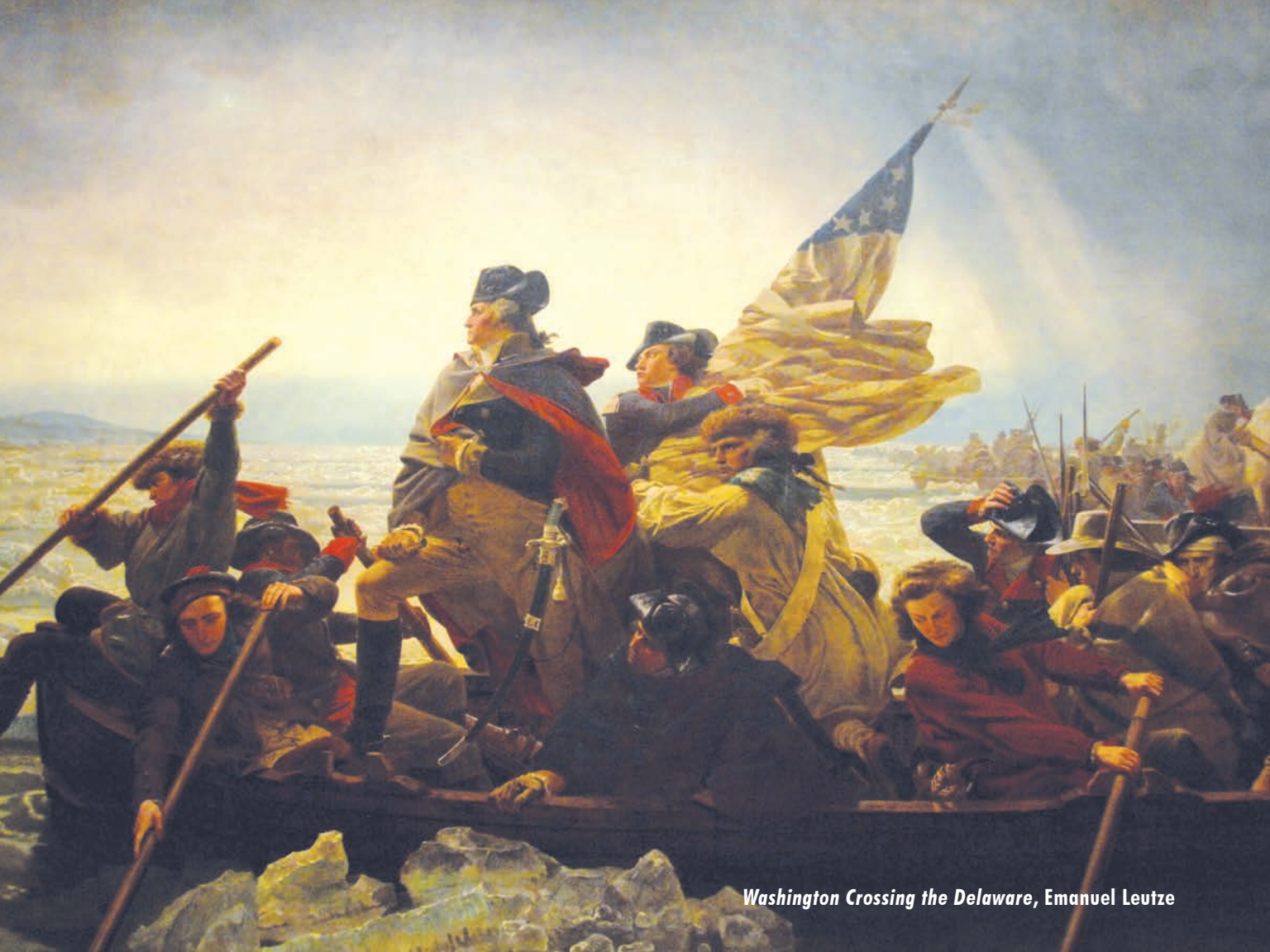
Washington Crossing the Delaware, Emanuel Leutze